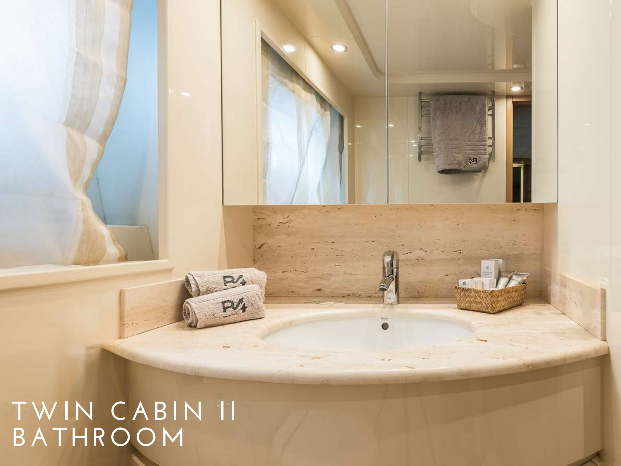
TWIN CABIN II BATHROOM