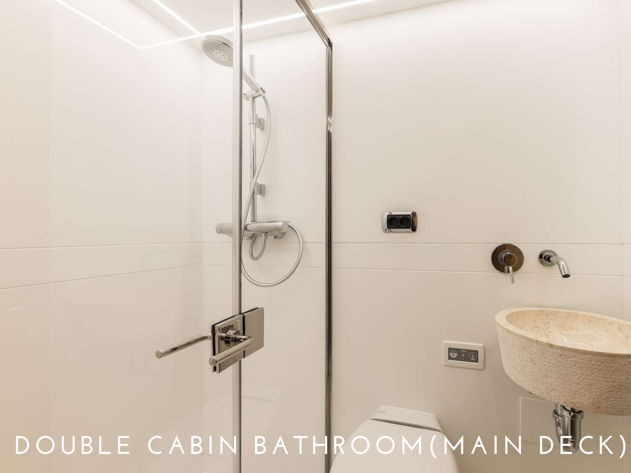
DOUBLE CABIN BATHROOM(MAIN DECK)