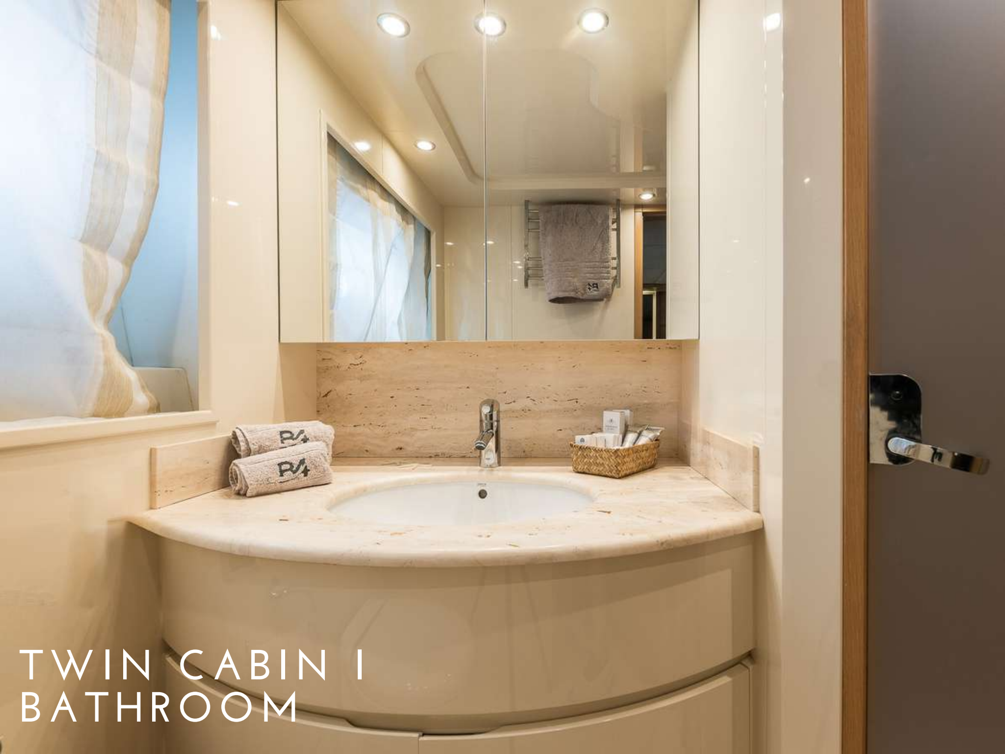
TWIN CABIN I BATHROOM